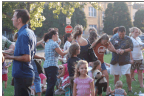
Tuition-Based Preschool Families